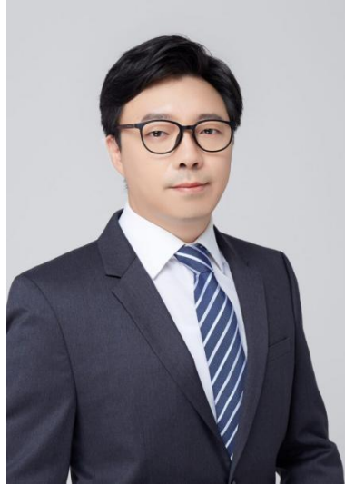
Professor Yihui Zhang (Tsinghua University)

For pioneering work on soft architected materials with unusual mechanical properties, rational 3D assembly driven by controlled buckling, and reconfigurable 3D mesostructures and electronics.